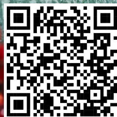
GIVING QR Code

Saint Thomas More University Parish Annual Report 2024